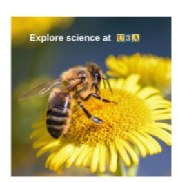
SCIENCE, OPEN FOR EVERYONE

Science Week 2024 -AUKUS, Implications and Possibilities!