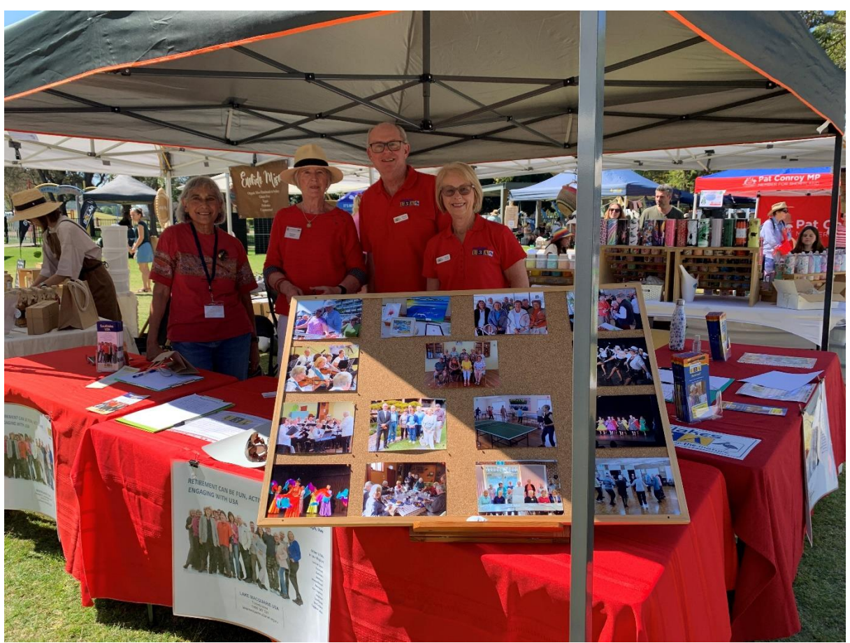
The stand featured that essential ingredient: smiling faces.

This was again a combined stand with Eastlakes and Southlakes U3As, so people were able to connect with the U3A closest to them.