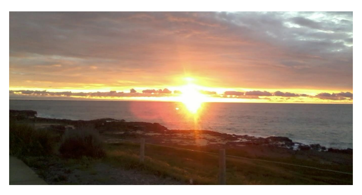
Sunset at beautiful Bunbury, venue for the WA 2024 Conference