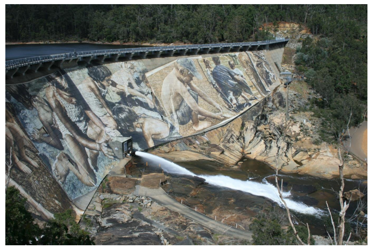
Wellington dam on the Collie River

These stops were just allowing time to build up their appetites before their ultimate destination: Evedon Retreat for their Christmas in July lunch.