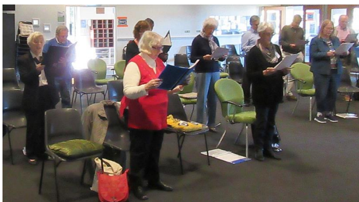
The U3A choir in Perth have started up again (using social distancing, of course)

Now there are glimmers of light on the horizon and activities are resuming. In many cases there are still restrictions on numbers but at least we seem to be heading in the right direction.