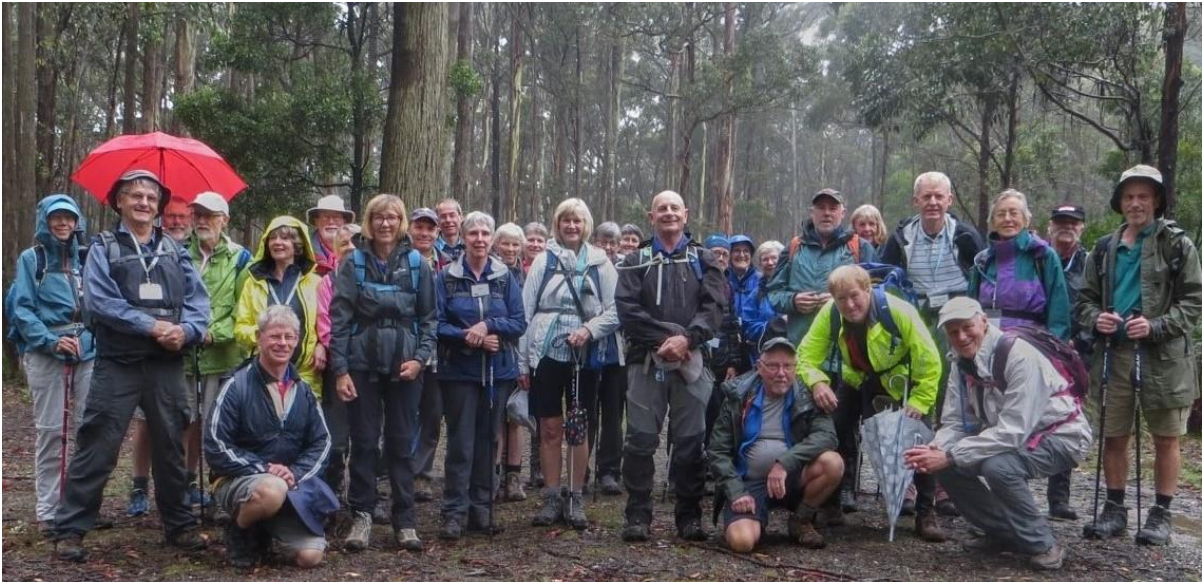
COVID uncovered hidden talents amongst the U3A Ballarat Hikers