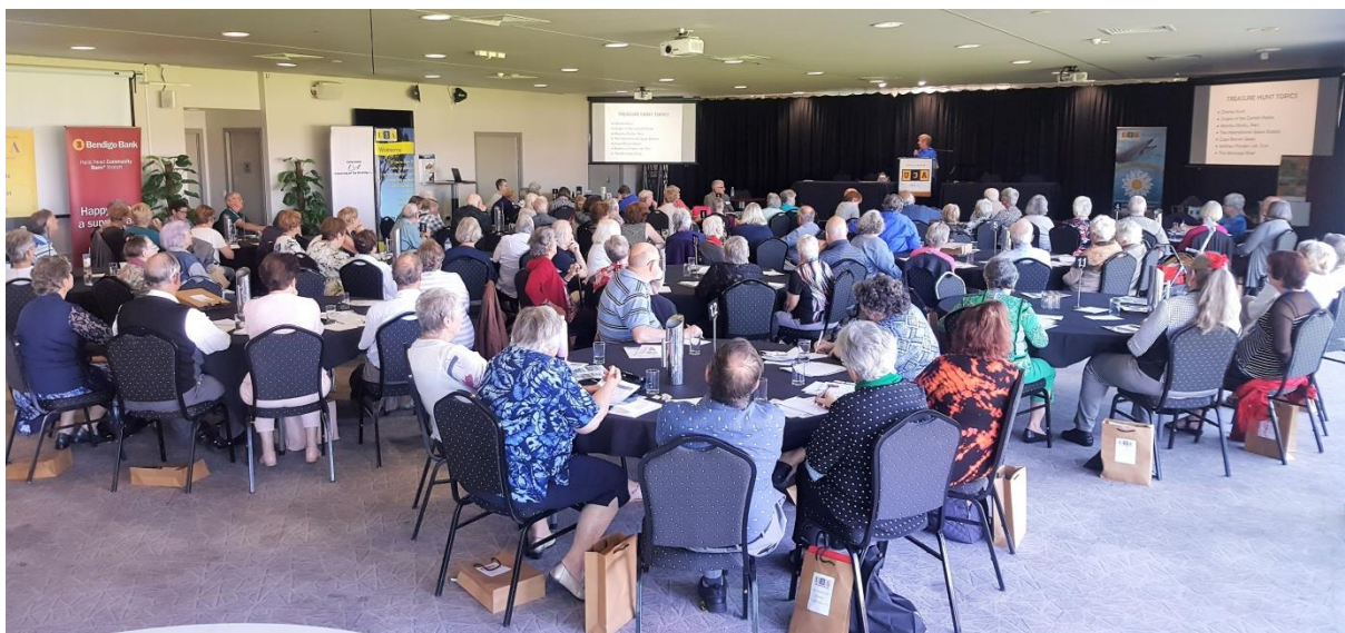
Racking their brains – the afternoon session on day one began with Brain Games