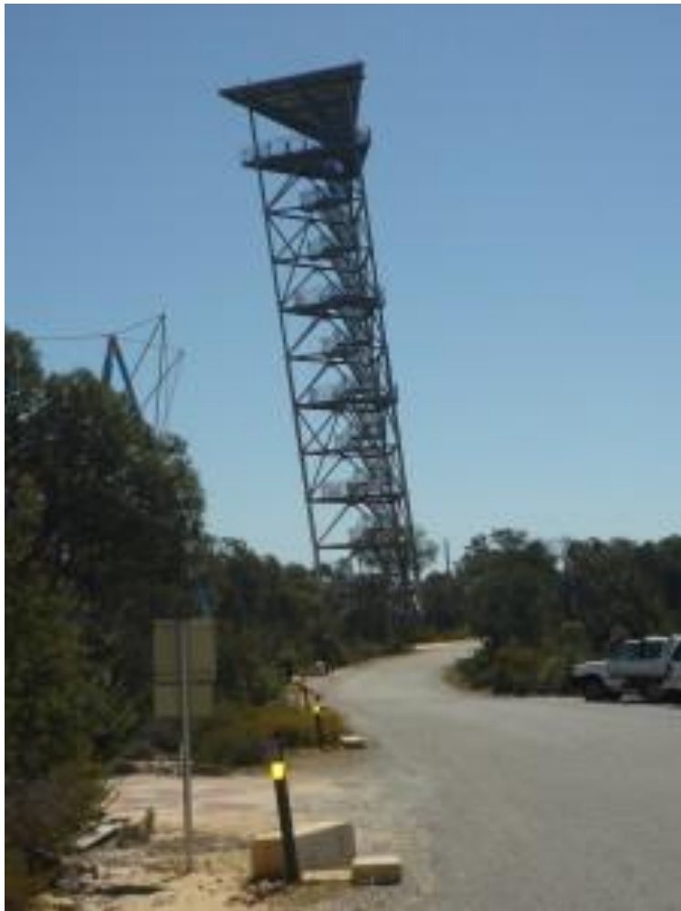
Armadale U3A excursion to the Gravity Centre at Gingin north of Perth