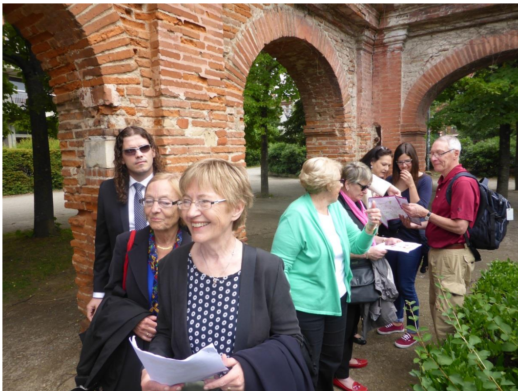
Delegates from Sweden, Brazil, Spain and Australia are shown around the University

I was given the opportunity to attend the IAUTA Extraordinary Assembly followed by the IAUTA General Assembly. In the extraordinary meeting the board voted on the acceptance or not of a U3A or general member to joining the IAUTA plus business that was to be taken to the IAUTA general assembly. In the general assembly they welcomed new members and voted on changes to their constitution and other relevant matters. The board is made up of people from many countries and a number of meetings are held online with face to face at conferences.